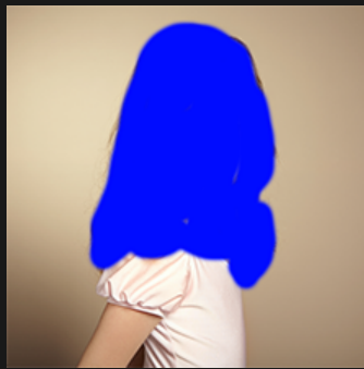
CREATE A NEW LAYER AND BRUSH YOUR IMAGE