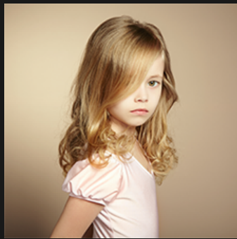
OPEN YOUR IMAGE IN PHOTOSHOP